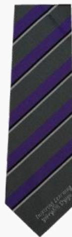
Chepstow School Whole School Tie