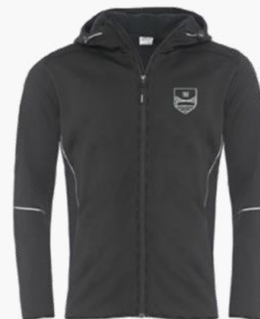
Chepstow School Swacket (optional)