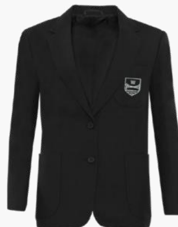
Chepstow School Black Blazer