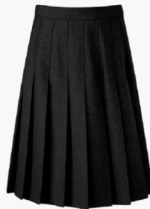
Black Pleated Skirt