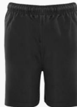
Black Sports Shorts