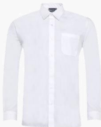
Plain White Shirt