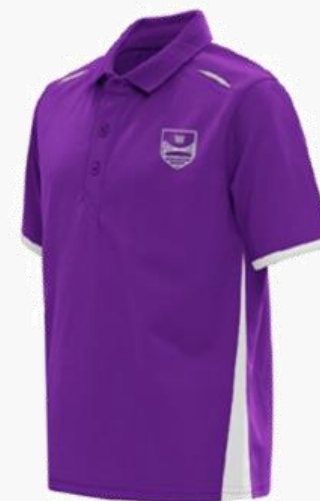
Chepstow School PE Polo Shirt