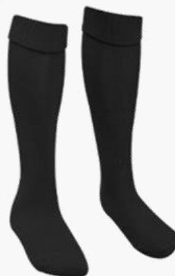
Black Sports Socks