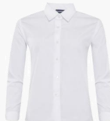
Plain White Blouse