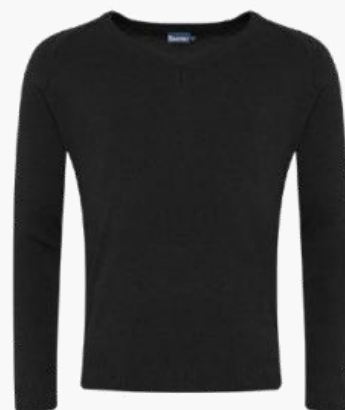
Optional Black V-Neck Jumper