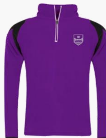
Chepstow School Quatro Fleece (optional)