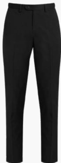
Black Tailored Trousers