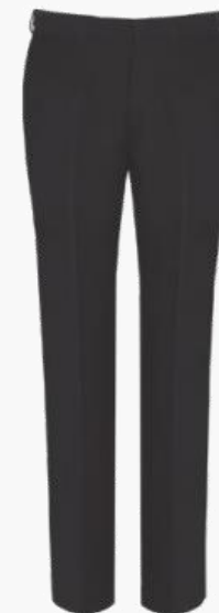
Black Tailored Trousers