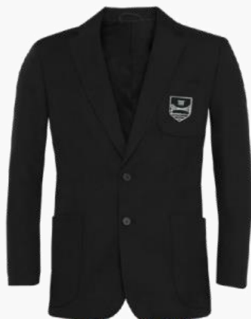
Chepstow School Black Blazer