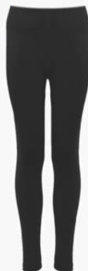
Black Sports Leggings