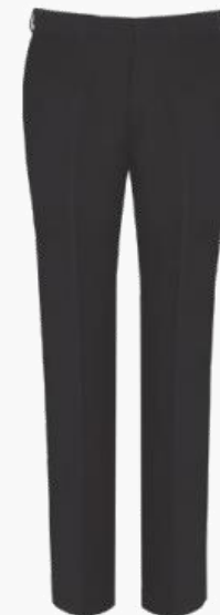
Black Tailored Trousers